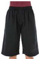
Woven navy shorts