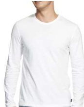
Plain white or navy T-shirt only to be worn under uniform