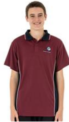
Maroon college polo shirt