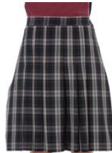
College Kilt Style Skirt.