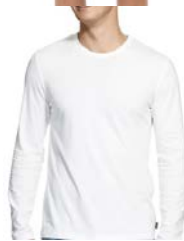
Plain white or navy T-shirt only to be worn under uniform