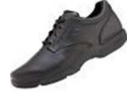
Predominantly Black covered-in shoes