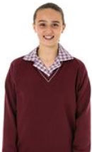
Maroon knitted woollen jumper