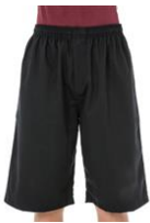
Woven navy shorts