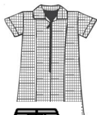
College Summer Dress