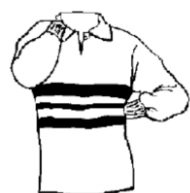
College sport polo shirt (mainly blue)