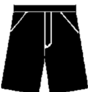
Woven navy shorts