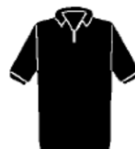
Maroon College polo shirt