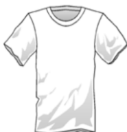
Plain white T-shirt only to be worn under uniform shirt