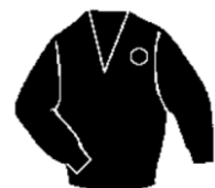
Maroon knitted woollen jumper