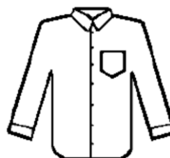
Woven long or short-sleeved shirt with College logo on pocket