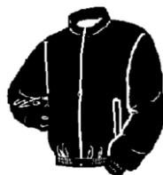
Long-sleeved or sleeveless polar fleece jacket

A blazer and school tie are also available.