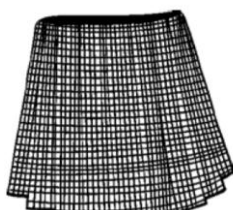
College Kilt-style Skirt